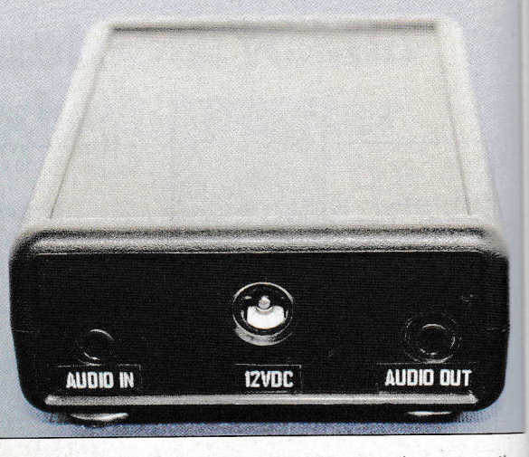
Figure 3 — Audio in and out, and 12 V dc connections are on the rear panel.

Refer to Table 1 for the LED event and state indicators and to Table 2 for the available button actions. Upon power up, the Bluetooth radio adapter will search for any previously paired Bluetooth headsets and attempt to connect with them. The adapter is discoverable and available for new pairings upon