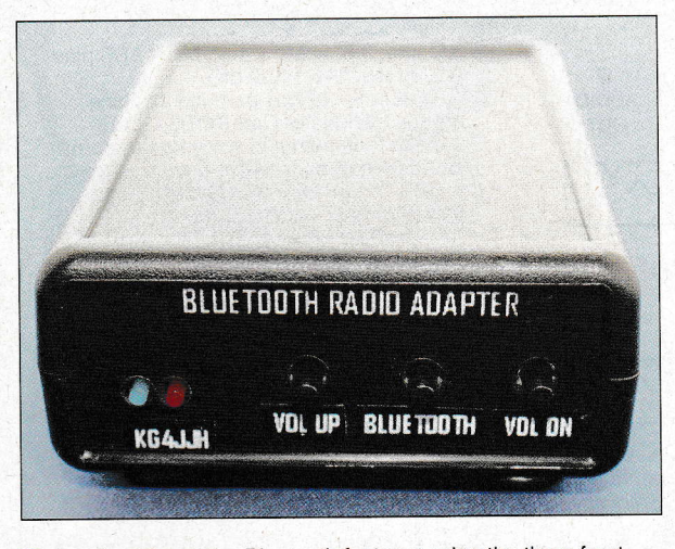
Figure 2 — Select the Bluetooth features using the three front panel pushbuttons and observe the Bluetooth state indications on the red and blue LEDs.

(Mouser 546-1593LBK). I show the LED bending dimensions and drawing on the QST in Depth web page. Also, be sure to remove the plastic tabs on the bottom of J1 and J2. Tap the PCB mounting holes with a 4-40 tap and install the PCB using four nylon 4-40 by <sup>3</sup>/<sub>16</sub> inch pan head machine screws (McMaster-Carr 94735A150). The nylon screws prevent shorting any PCB traces and reduce the amount of metal around the antenna. I provide a drill template for the enclosure front and rear panels to aid in hole cutting on the QST in Depth web page. Print the PDF template full size with no page scaling, align the template center lines with the panel center lines, and secure it to the panel using a temporary adhesive such as a glue stick. Add four sticky-back rubber feet on the bottom to complete the enclosure.