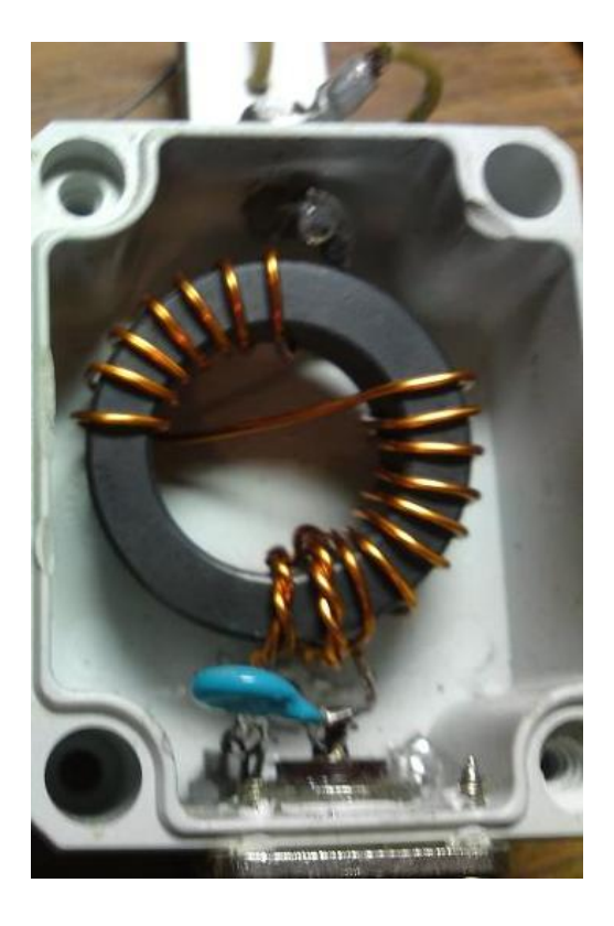
Goed twisten voor de eerste 2 wdg.