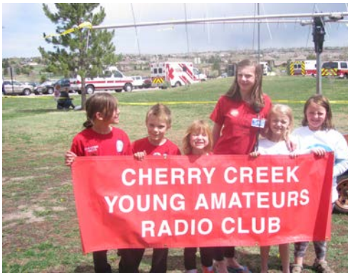
Members of the club (W0CCY) at an ARES training event held at Grand View High School in Aurora, Colorado.

If you haven't had a chance to get licensed please consider the upcoming class. Online self-study is also available anytime. As a reminder we have a 10 channel programmed radio for each student that gets licensed. That's right your first radio is FREE. Thanks to everyone for their support of the Cherry Creek Young Amateur Radio Club!