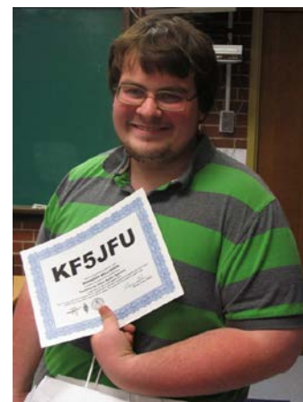
A student at Pine Tree High School in Longview, Texas celebrates his accomplishment.